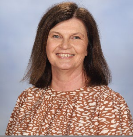
DEPUTY PRINCIPAL REPORTS YEARS 8 & 12