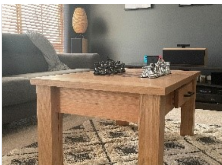
TECHNICAL AND APPLIED STUDIES