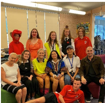
CREATIVE & PERFORMING ARTS