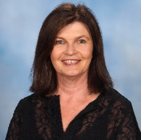
DEPUTY PRINCIPAL'S REPORT 7/9/11