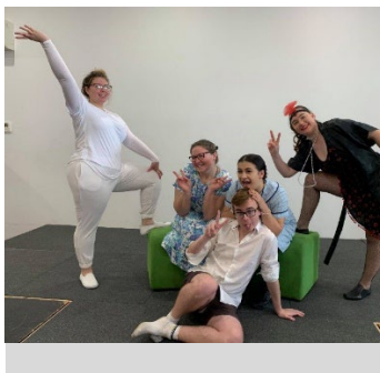
ENGLISH & DRAMA