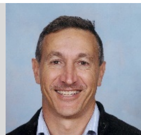
DEPUTY PRINCIPAL'S REPORT - 8/10/12