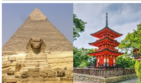
HSIE & LANGUAGES