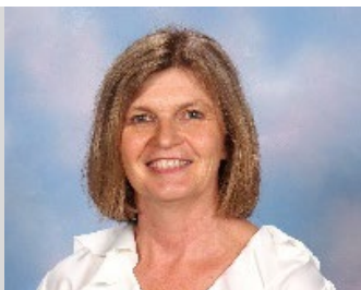
DEPUTY PRINCIPAL'S REPORT - 7/9/11