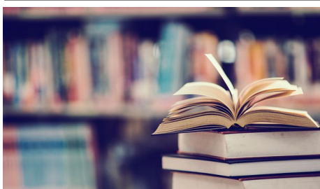
ENGLISH & DRAMA