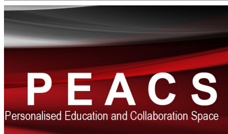
TEACHING & LEARNING