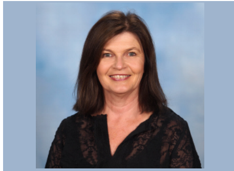
DEPUTY PRINCIPAL'S REPORT 7/9/11