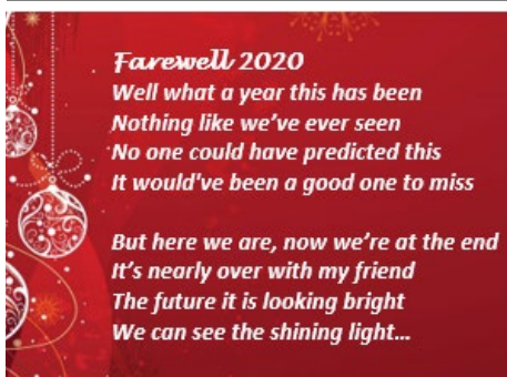
ENGLISH AND DRAMA FACULTY