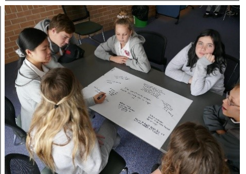
TEACHING & LEARNING FACULTY