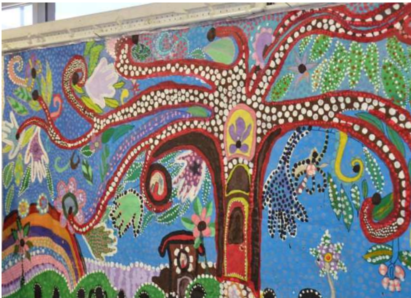
The finished banner designed and created for the "Smart Art Includes You" Challenge

With the prize money we hope to purchase much needed art supplies for the banners we do that support many of the causes our kids are passionate about that run in our school. Also, funding will be used for some projects for girls' and boys' groups.