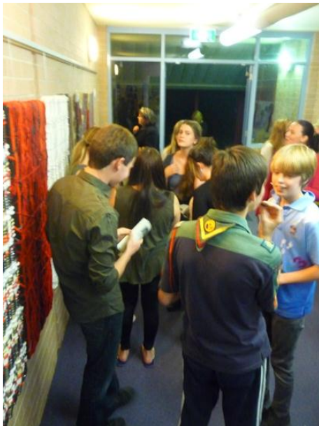
Students enjoying the exhibition