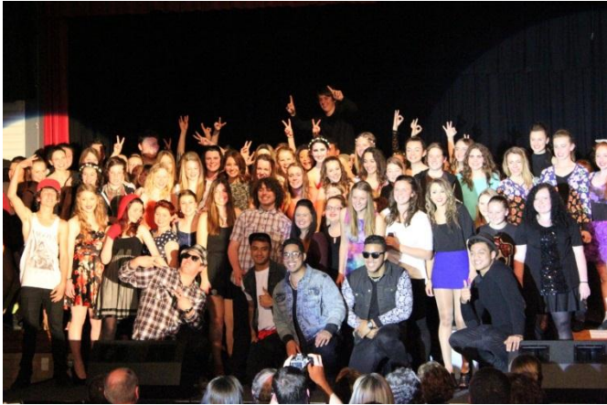
The whole cast