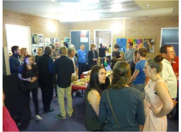
CAPA Grad exhibition