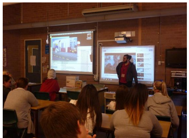
Aim High Presenter