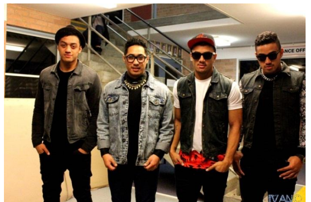
Guest Performers "Fourtunate"