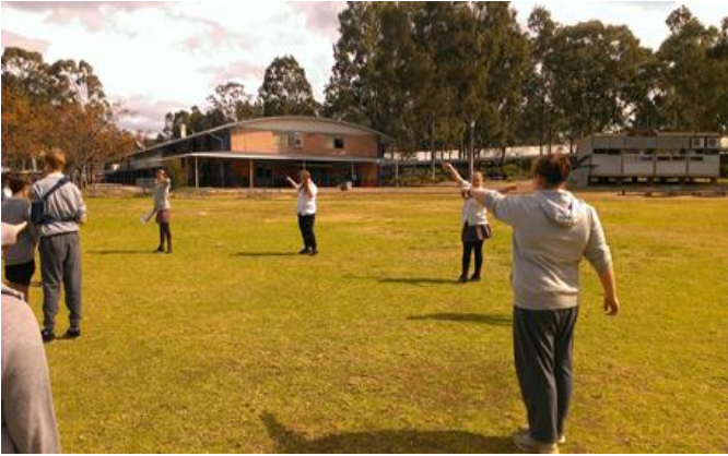
This photo shows the students pointing in the direction where they think the echoes were coming from, while listening with their eyes closed. A lot of fun was had in trying to distinguish the Geography building from the water tanks and the canteen.