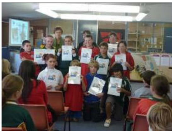
GATS Term 2 Science class