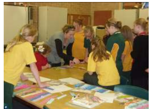
GATS Term 3 Textiles program