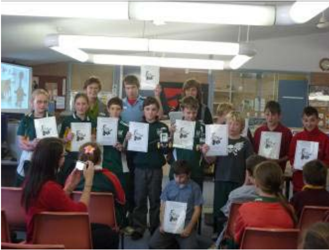
GATS Term 2 Robotics class