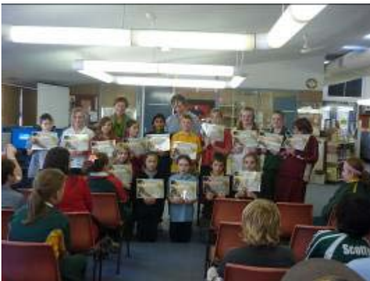
GATS Term 2 Ceramics class