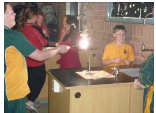
GATS Term 3 Science program