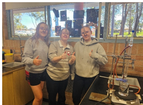
SCIENCE & AGRICULTURE