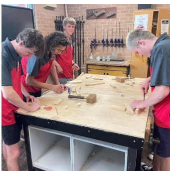
TECHNICAL & APPLIED STUDIES