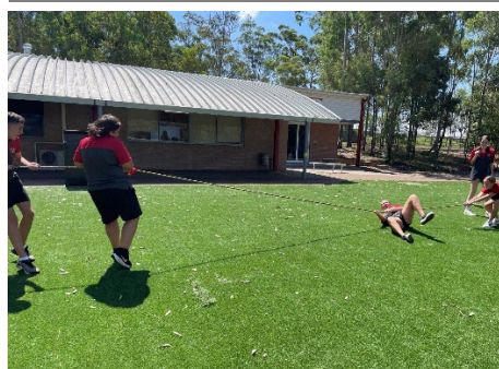
SCIENCE & AGRICULTURE