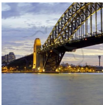
FUTURES CENTRE & VET