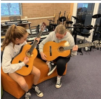
CREATIVE & PERFORMING ARTS