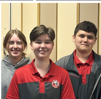
ENGLISH & DRAMA