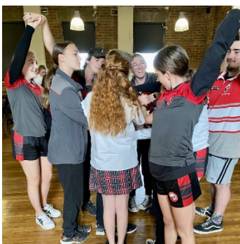
TEACHING & LEARNING