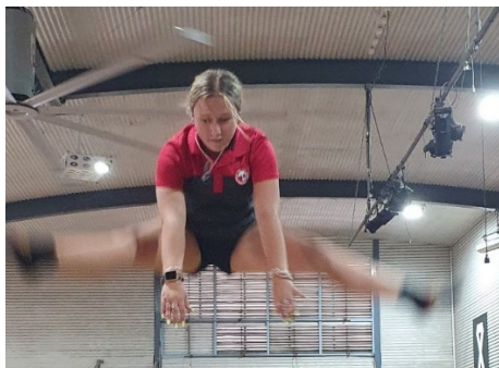
PERSONAL DEVELOPMENT, HEALTH & PHYSICAL EDUCATION