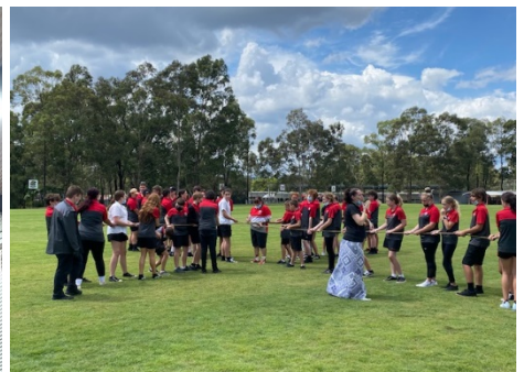
SCIENCE & AGRICULTURE