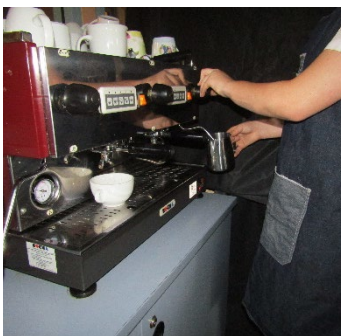
TECHNICAL & APPLIED STUDIES