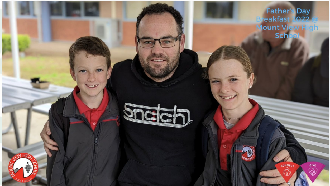
Father's Day Breakfast 2022 @ Mount View High School