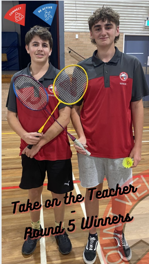
Take on the Teacher - Round 5 Winners