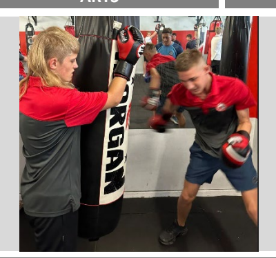
TEACHING & LEARNING