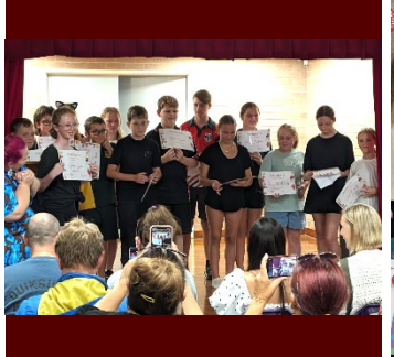
ENGLISH & DRAMA