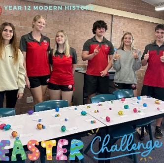
HUMAN SOCIETY & IT'S ENVIROMENT